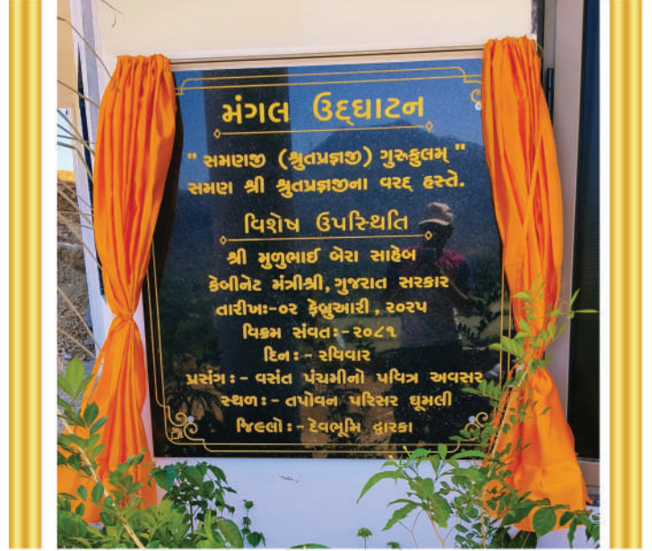
Plaque Unveiling – Samanji Gurukulam: By Samanji & Esteemed Donors

Heartfelt gratitude to all donors for shaping the future of these students!