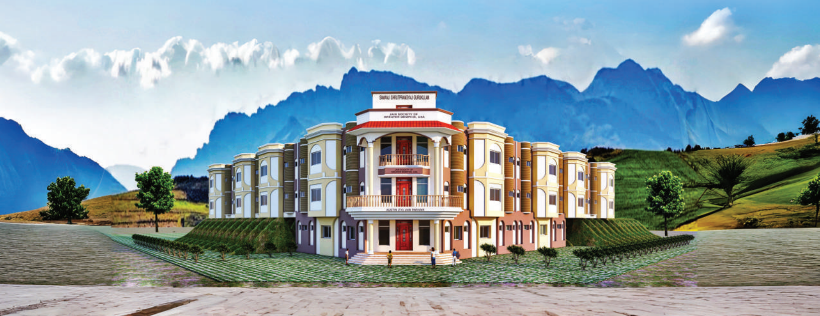
Samanji Gurukulam - Bhanvad

Join us in celebrating this new chapter, filled with devotion, community, and the spreading of wisdom.