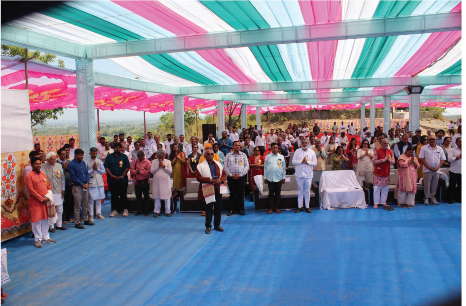
Samanji Gurukulam was inaugurated by Samanji and esteemed donors.