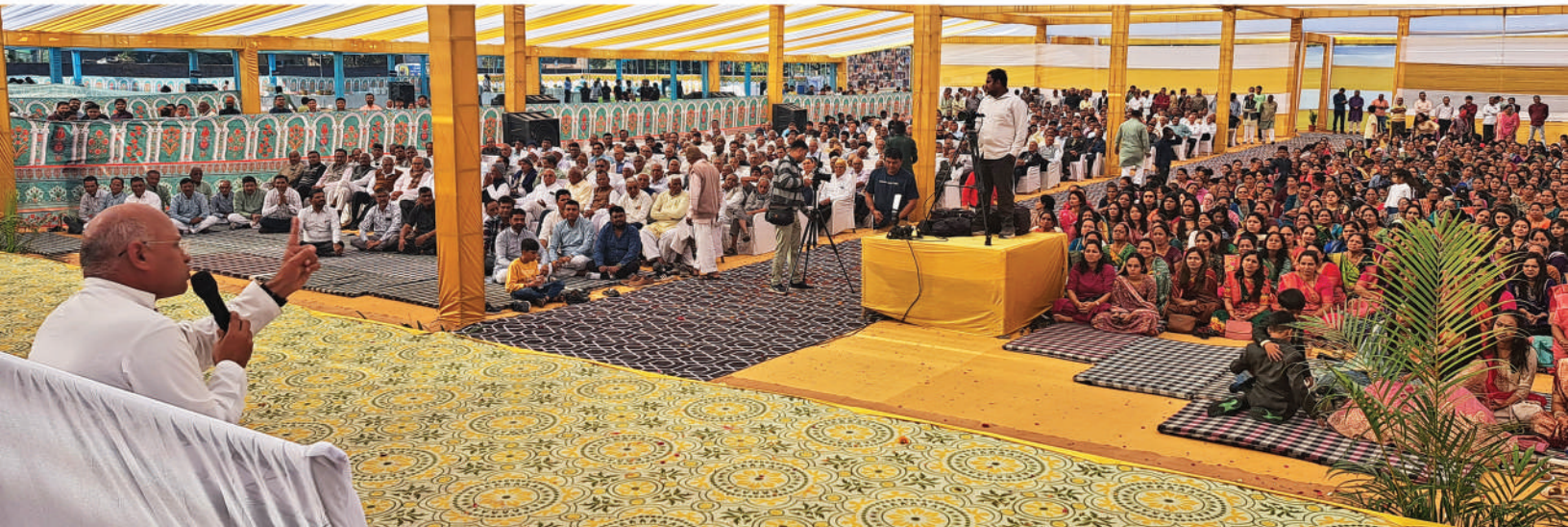
Samanji Gurukulam - Bhanvad